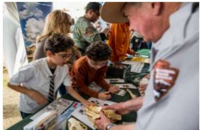
Two children interacting with a park ranger at The National Park Experience Pavilion at the Tucson Festival of Books in Tucson, Arizona.

The National Parks Store in Tucson, Arizona, offers a variety of educational programs. Past topics include Native basketry, flute making, pottery techniques, and Navajo rug weaving, with attendance exceeding five thousand people annually. The premiere community event of the year is the sponsorship of The National Park Experience Pavilion at the Tucson Festival of Books. The Pavilion provides the opportunity for 20 national parks from the western United States to connect with more than 140,000 festival attendees, bringing national parks to the people and the diverse communities they serve.