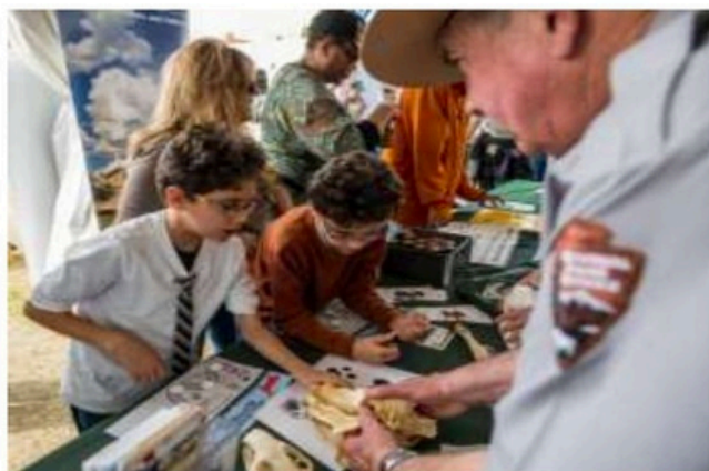
Two children interacting with a park ranger at The National Park Experience Pavilion at the Tucson Festival of Books in Tucson, Arizona.

The National Parks Store in Tucson, Arizona, offers a variety of educational programs. Past topics include Native basketry, flute making, pottery techniques, and Navajo rug weaving, with attendance exceeding five thousand people annually. The premiere community event of the year is the sponsorship of The National Park Experience Pavilion at the Tucson Festival of Books. The Pavilion provides the opportunity for 20 national parks from the western United States to connect with more than 140,000 festival attendees, bringing national parks to the people and the diverse communities they serve.