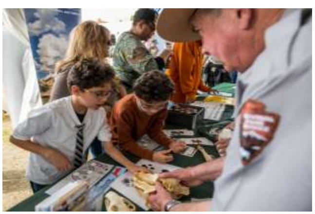
Two children interacting with a park ranger at The National Park Experience Pavilion at the Tucson Festival of Books in Tucson, Arizona.

The National Parks Store offers a variety of educational programs in Tucson, Arizona. Past topics include Native basketry, flute making, pottery techniques, and Navajo rug weaving, with attendance exceeding five thousand people annually. The premiere community event of the year is the sponsorship of The National Park Experience Pavilion at the Tucson Festival of Books. The Pavilion provides the opportunity for 20 national parks from the western United States to connect with more than 140,000 festival attendees, bringing our national parks to the people and the diverse communities they serve.