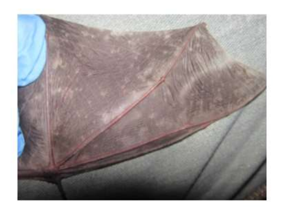
Bat Biologists Monitor CAVE Bats for White-Nose Syndrome May 27, 2021

The Battle and the Battleground Bats, those insecteating mammals we see at dusk as they flutter... Read more »