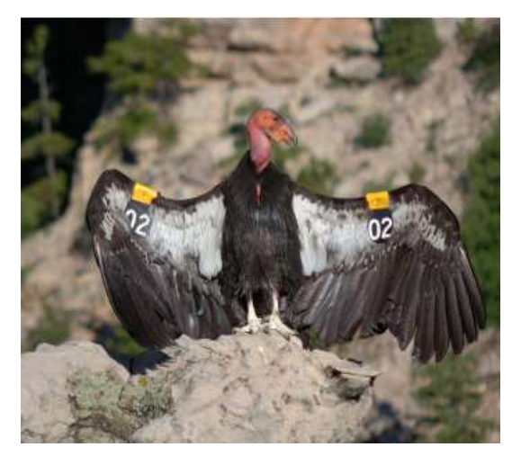
The endangered California condor

Make an educational product or experience with new technology: record a podcast, hold a video call with a classroom of students, or film a virtual tour of your research area to share online.